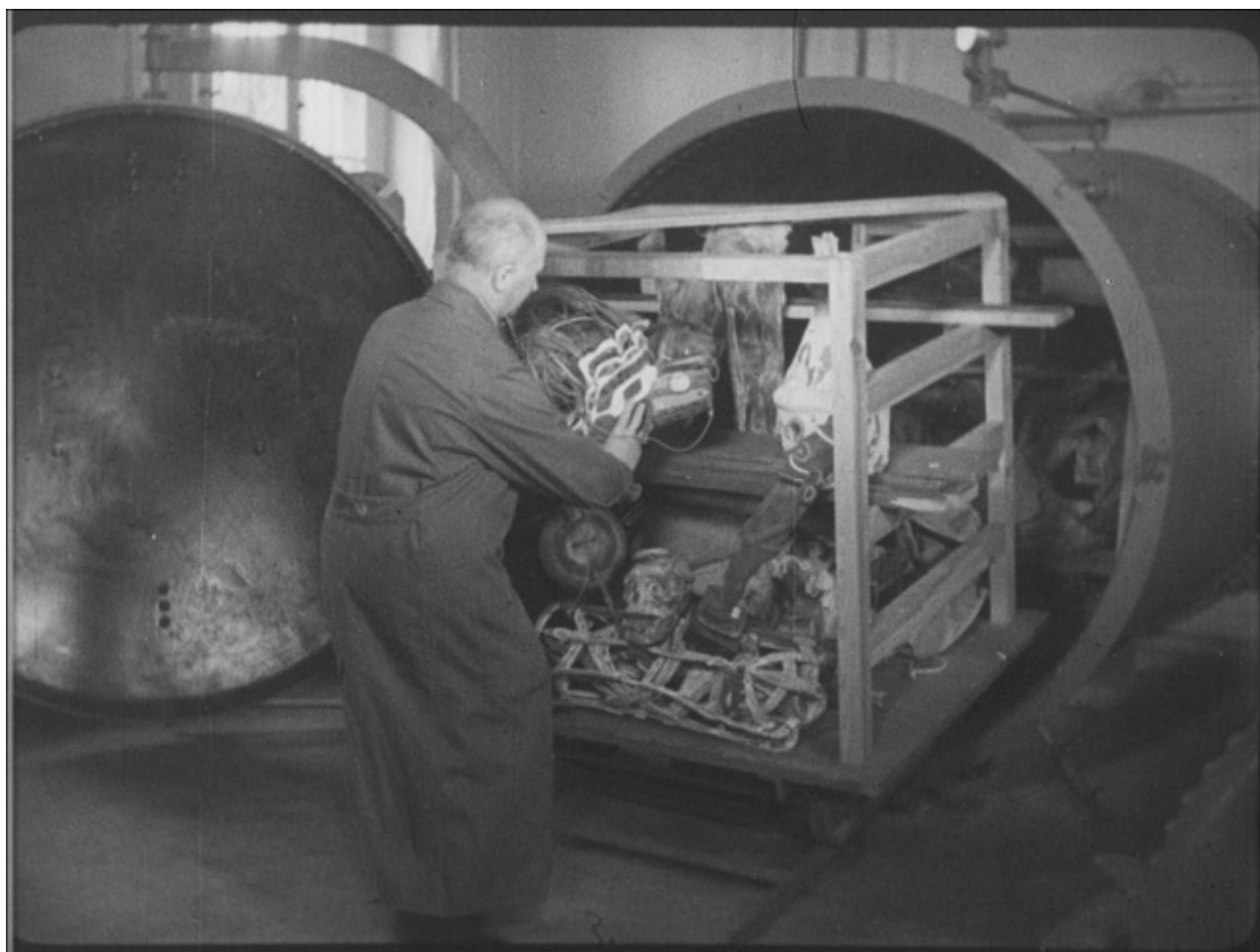
Fumigation system at the Staatliches Museum für Völkerkunde zu Berlin, closed condition, 1923.

Chapter 3 zooms in to the introduction of chemical treatments at the Ethnological Museum Berlin. Tello retraces how, in the decades of Germany's expansionist colonial politics between the Berlin conference 1884 and the end of World War I, colonial collecting led to the rapid expansion of museum storage, transferring thousands of objects in different climatic conditions, narrow spaces, managed by museum staff that was often overburdened with the masses of artefacts. In these conditions, organic materials such as wood, plant fibers, hide, leather, feathers, and textiles were frequently exposed to insects, rodents, humidity and mold. Chemical substances were introduced in the collections in search for efficient means to protect them from decay. Helene Tello's study retraces in great detail how the general administration of the former Royal Museum of Berlin / the National Museums of Berlin, the chemical